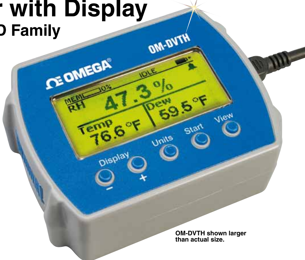
OM-DVTH shown larger than actual size.

The OM-DVTH temperature/relative humidity data logger with display is an easy-to-use, versatile device which can be used for a wide range of logging applications. The OM-DVTH records and instantly displays trends for temperature, humidity and dew point. With the OM-DVTH you can monitor real time measurements for instant environmental conditions. When you're ready, download over 40,000 data points to your PC for further analysis. Data logging has never been this visual. The OM-DVTH is capable of sampling as fast as once per second or as slow as every 18 hours. A total of 43,344 temperature measurements can be stored in the data logger memory if only