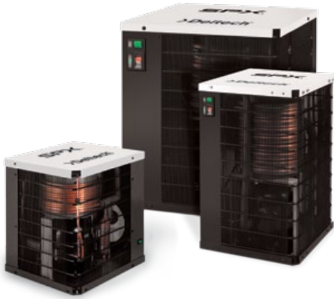
Efficient Smooth Copper Heat Exchangers

Customers around the world have relied on Deltech for great value in air treatment solutions. Deltech Value Line Refrigerated Dryers offer a simple solution based on a long history of industry leading technology.