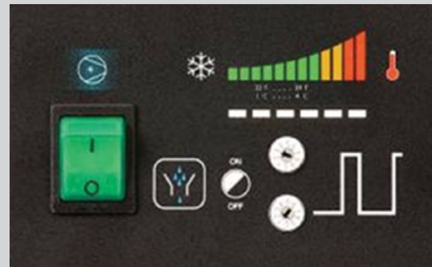
Controls: Models 200-500 scfm