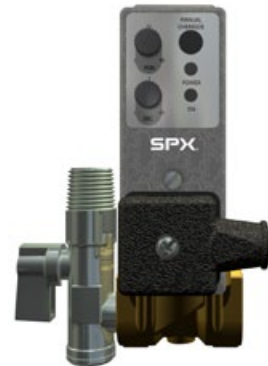
Adjustable Timed Electric Drain