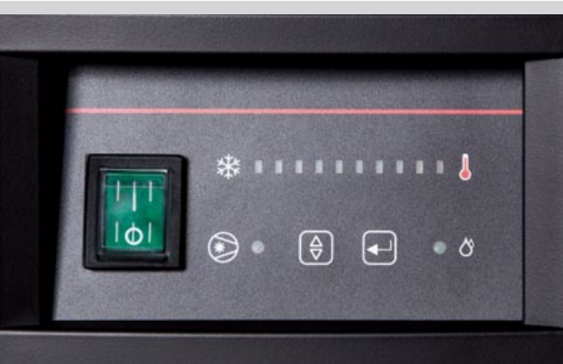
Controls: Models 200-500 scfm