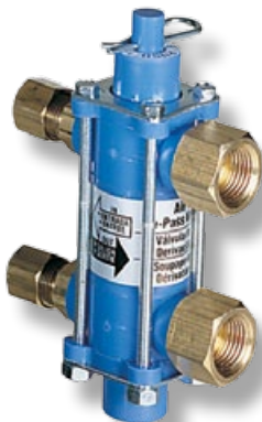
Air Bypass Valve